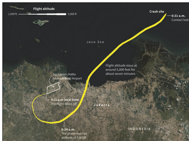
Approximate flight path of Lion Air 610.

may have been operating with sensors or computers that were not reading correct parameter values. The pilots seemed to have struggled to override an automatic system that was pointing the nose of the plane down, suggesting that the automatic system may have been working improperly.