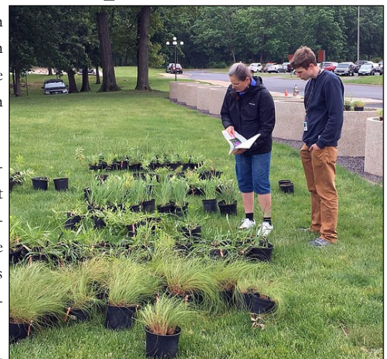
Workers monitor pollinator-friendly plants at the Illinois Department of Transportation headquarters.