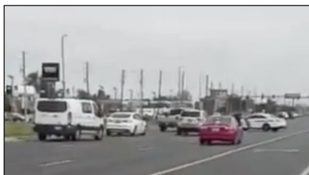
A group of cars are pulled over for passing a stopped school bus with its stop arm out.

These children were either waiting for the bus or crossing the street to board one when they were struck and killed by drivers who failed to stop for the bus or failed to stop for children on the road. Other children were also injured in these and other events during the same week. Not stopping for a school bus picking up and dropping off students is against the law nationwide, but there is an epidemic of drivers disregarding the rules and passing school buses even when the stop arm is extended.