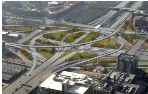
Artist’s rendition of renovated Jane Byrne Interchange, facing west.

The Illinois Tollway Authority held a public meeting in early March to update commuters on the status of the Jane Byrne Interchange. Popularly known as the “Circle” interchange, this junction between the Dan Ryan (Interstates 90/94) and the Eisenhower (Interstate 290) expressways has been undergoing a massive makeover, its first since its creation in the 1950s.