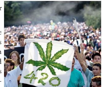
CANNABIS ENTHUSIASTS AND ACTIVISTS GATHER FOR AN ANNUAL "420" CELEBRATION.

Reporting System (FARS) database that Staples and Redelmeier (2018) employed. As a result, it is still unclear how many of the fatal accidents on April 20 specifically involved drivers under the influence of THC.