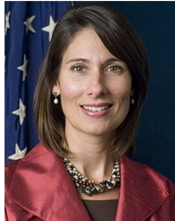
NATIONAL SAFETY COUNCIL CEO DEBORAH HERSMAN DISCUSSES THE POSSIBLE WAYS A CHANGING ECONOMY CAN AFFECT TRAFFIC FATALITY OCCURRENCE.

Over a ten-year trend, after the market collapse in 2008, traffic fatalities decreased with the lowest year of fatalities in 2011. There has been a steady increase in fatalities since 2014. The NSC claims a relationship between number of fatalities and the state of the U.S. economy, noting that as the economy improves, more people can afford to plan discretionary travel.