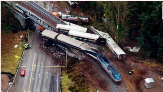
AMTRAK TRAIN CARS DANGLE OFF OF A BRIDGE AFTER A DERAILMENT OUTSIDE SEATTLE IN DECEMBER 2017.

rate of Amtrak accidents per million train miles traveled increased from 41.1 to 58.8 between 2008 and November 2017. 119 died in Amtrak related accidents in 2008, and 167 died January through November 2017. Specifically, the rate for Amtrak related accidents that were not at a road crossing decreased from 2.4 to 1.4 between 2008 and November 2017, suggesting that accidents at railroad crossings have increased.